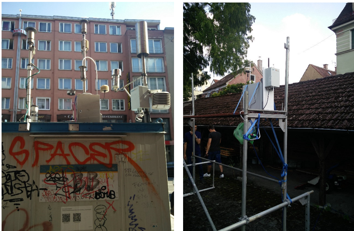
Figure 3: Measuring sites Karlstraße (left) and Klostergarten (right)