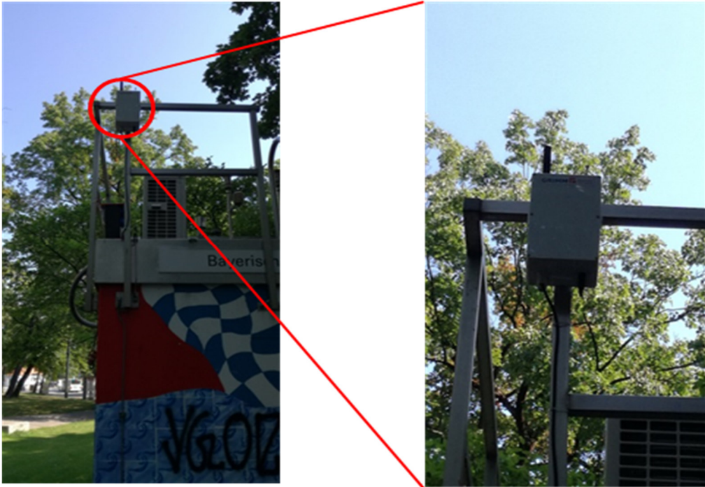
Figure 9: EDM80NEPH at the measurement site at Bourges Platz