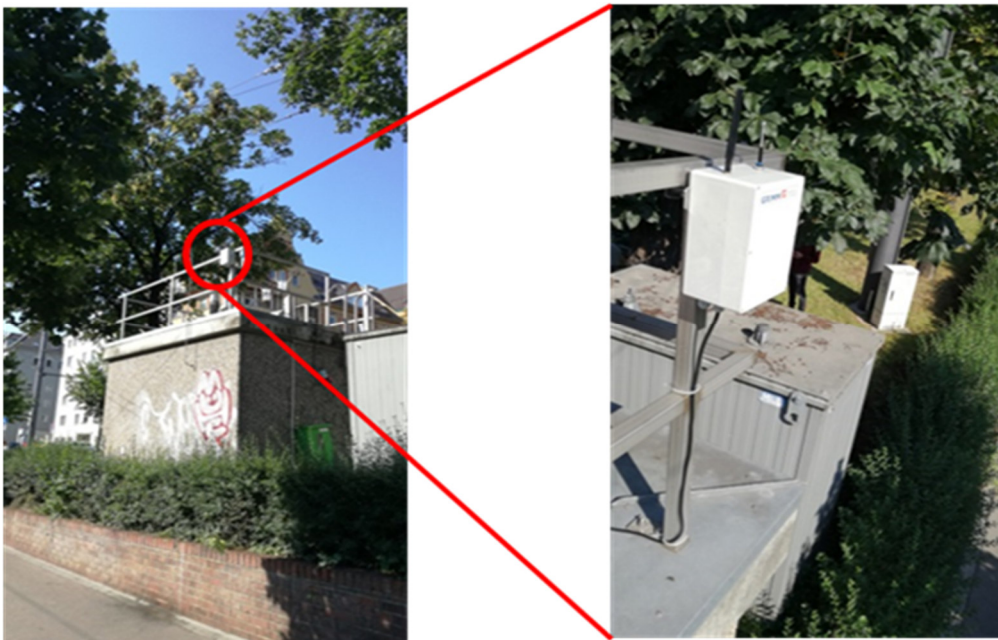
Figure 7: EDM80NEPH at the measurement site Königsplatz