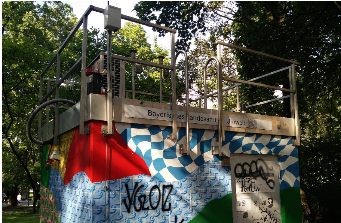
Figure 4: Measuring site Bourgesplatz

The second day started with intensive discussions (like shown in Figure 5) dealing with the planned external Workshop in December, a possible Video shooting within the IOP, approaching IOP planning needs, publication plans and so on. More details will follow within the minutes of the meeting.