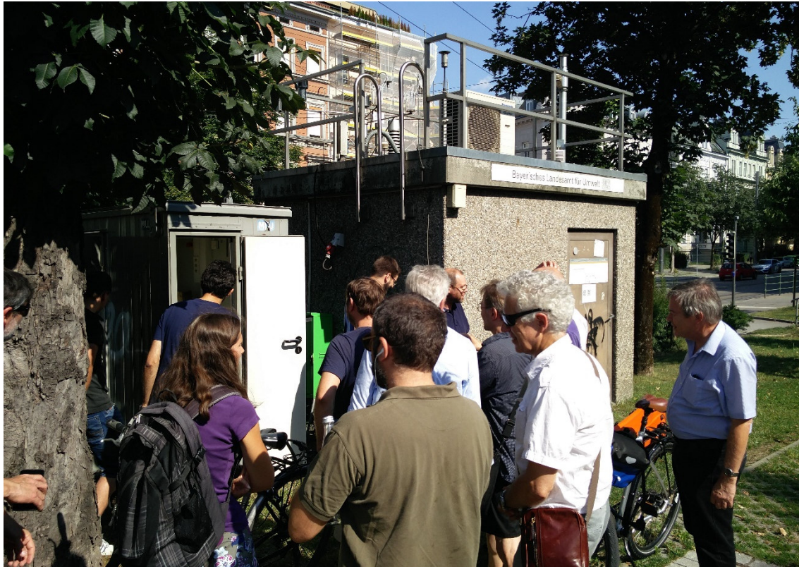
Figure 2: Measuring site Königsplatz

The second session was closed by a discussion round and subsequently to a short break, all participants took part in a sightseeing tour to the potential measurement sites in Augsburg. Some impressions of the tour can be found in Figure 2 to Figure 4.