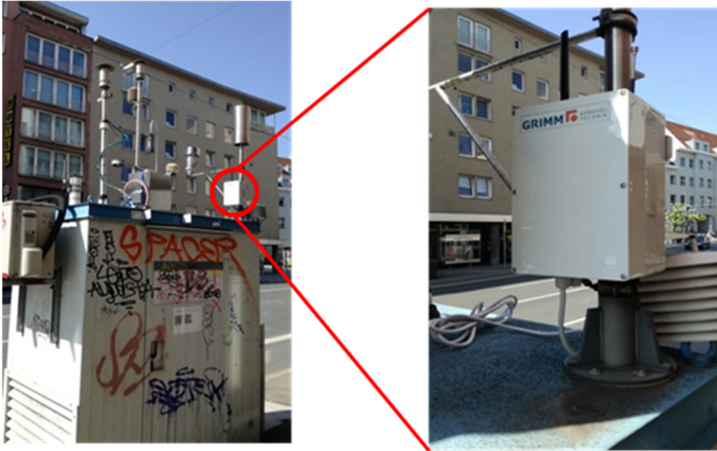
Figure 8: EDM80NEPH at the measurement site Karlstraße