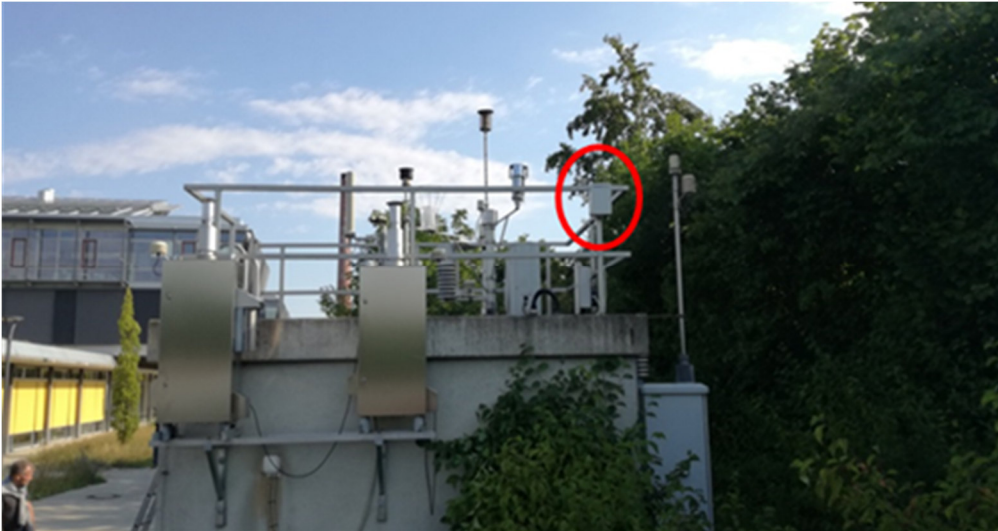
Figure 6: EDM80NEPH at the measurement site LfU headquarter