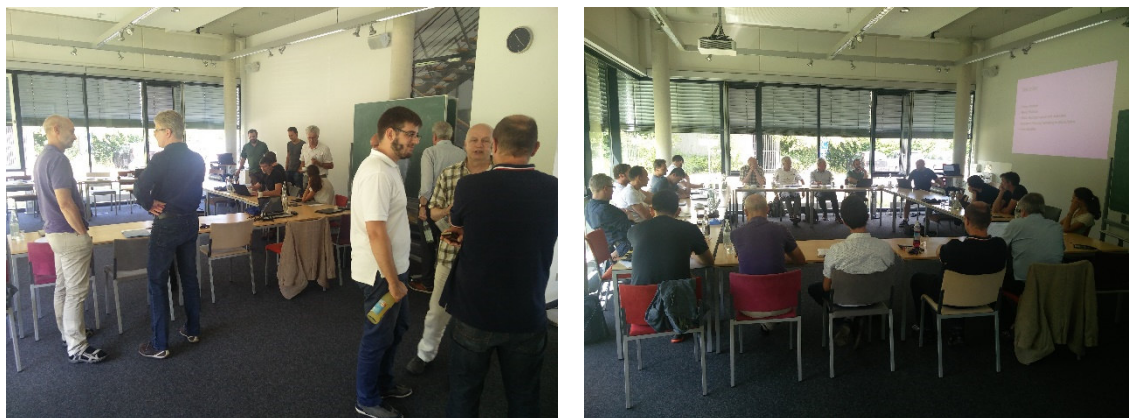
Figure 5: Intensive discussions at the meeting in Augsburg

The second day started with intensive discussions (like shown in Figure 5) dealing with the planned external Workshop in December, a possible Video shooting within the IOP, approaching IOP planning needs, publication plans and so on. More details will follow within the minutes of the meeting.